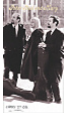
Carry It On 2004