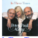
In These Times 2004