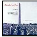
Songs Of Conscience & Concern 1999

HOME the music albums the tour the gallery the people the history the giftshop